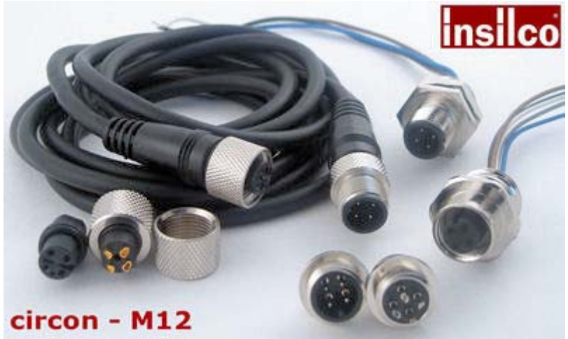
circon - M12

INELCO's circular connectors are made for Ethernet data communications in industrial environment up to IP67. INELCO fulfills all requirements given by the IEC Standard IEC 61076-2-101 for M12 connectors with screw-locking for low voltage application. The 4 pole connector is designed for use in industrial environment at frequencies of 100 MHz and beyond like Industrial Ethernet. The 5 pole connector is designed for use in industrial environment in fieldbuses like Profibus DP and Interbus.